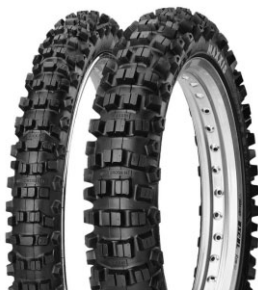
M7300 Front / M7301