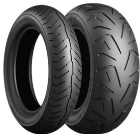
G853 Front & G852 Rear