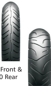
G851 Front & G850 Rear