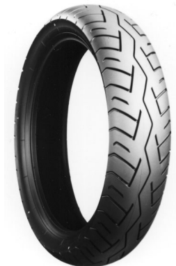
BT45 V Rear