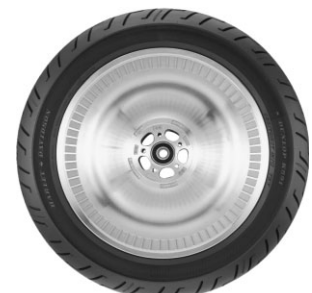
Speed Index V