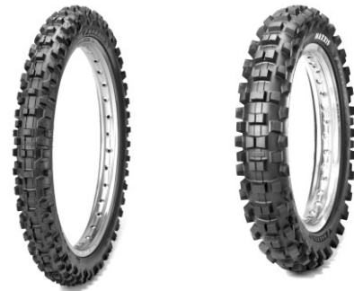
SI Front M7311