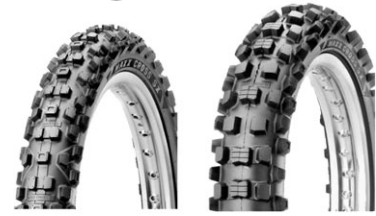
SX Front M7309