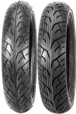
Speed Index W