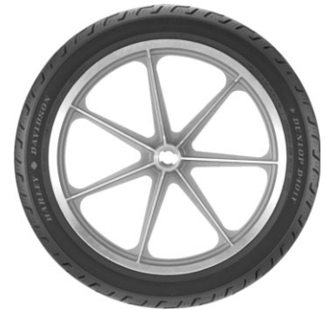
Speed Index H