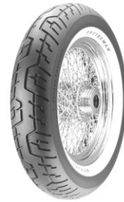
Speed Index H