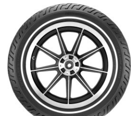
Speed Index H