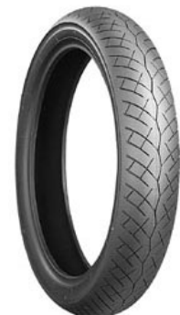
BT45 V Front