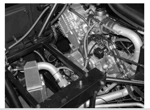
Rhino Supercharger - Overall