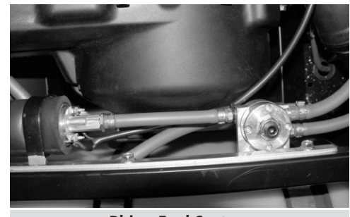
Rhino Fuel System