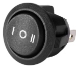
710-6102 (kit) 710-5900 replacement switch only