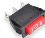
710-6105 (kit) 710-5904 replacement switch only