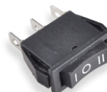
710-6104 (kit) 710-5903 replacement switch only